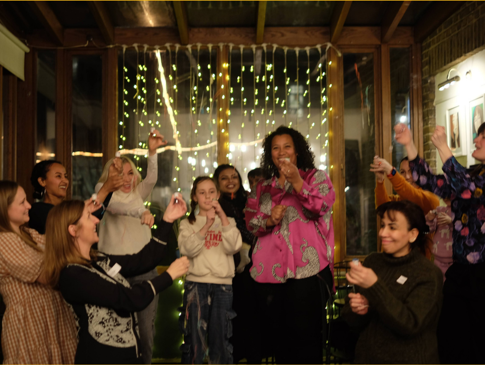
Photo from our End of Programme celebration with our cohort of mentors and mentees in 2024

Huge thanks to all our supporters and funders this year!